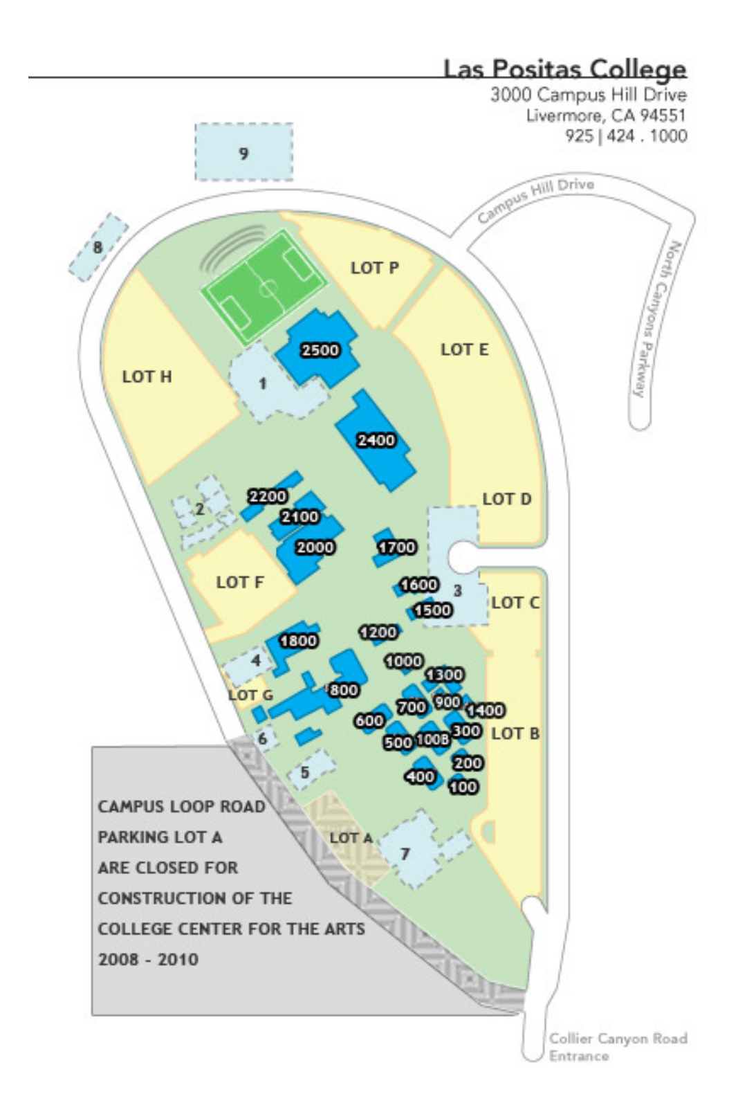
Bldg. 2400 – Multi-Disciplinary Building Room 2401- Reading Room