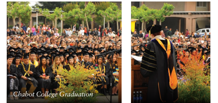
Chabot College Graduation