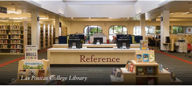
Las Positas College Library