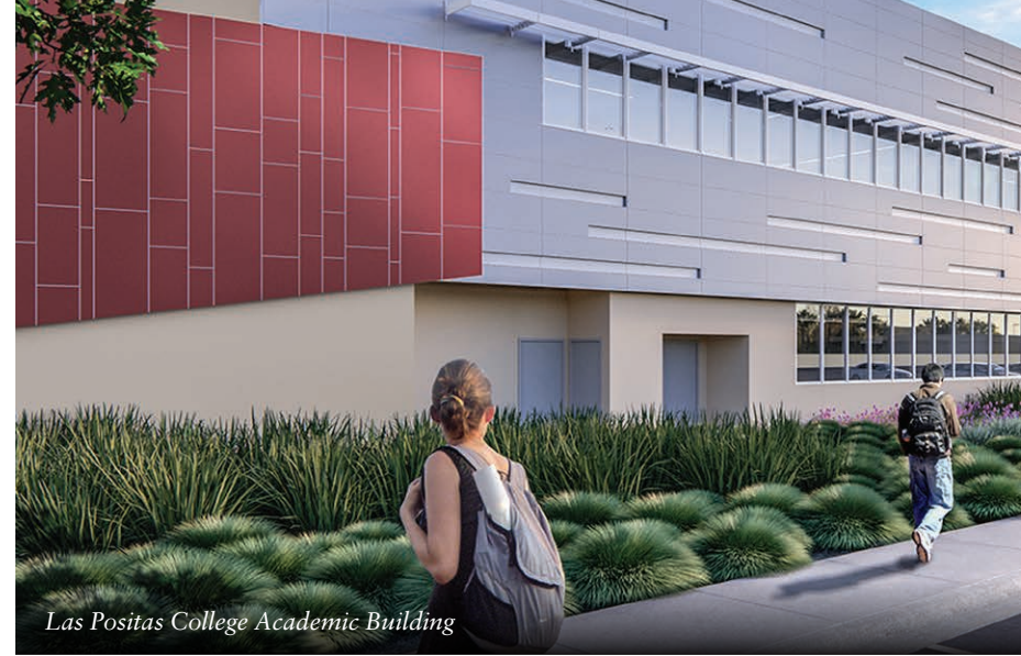
Las Positas College Academic Building