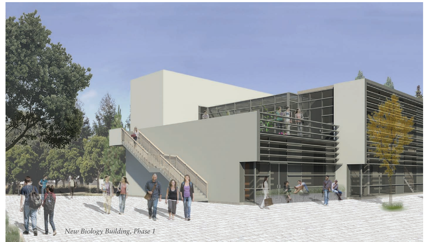
New Biology Building, Phase 1