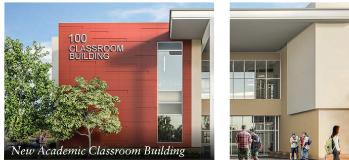
New Academic Classroom Building