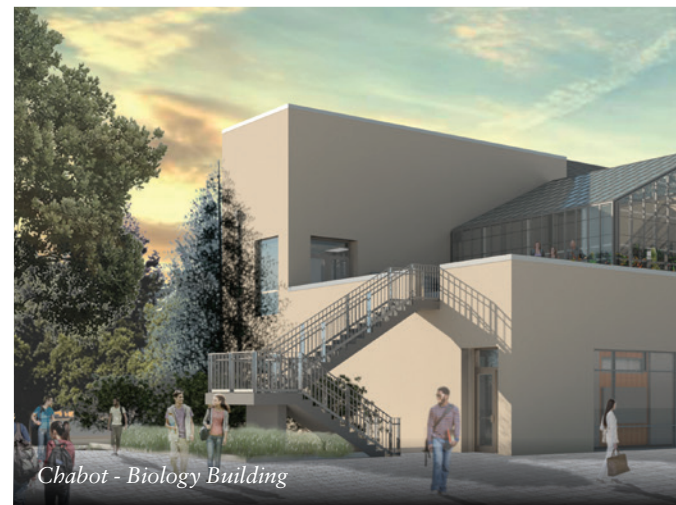
Chabot - Biology Building