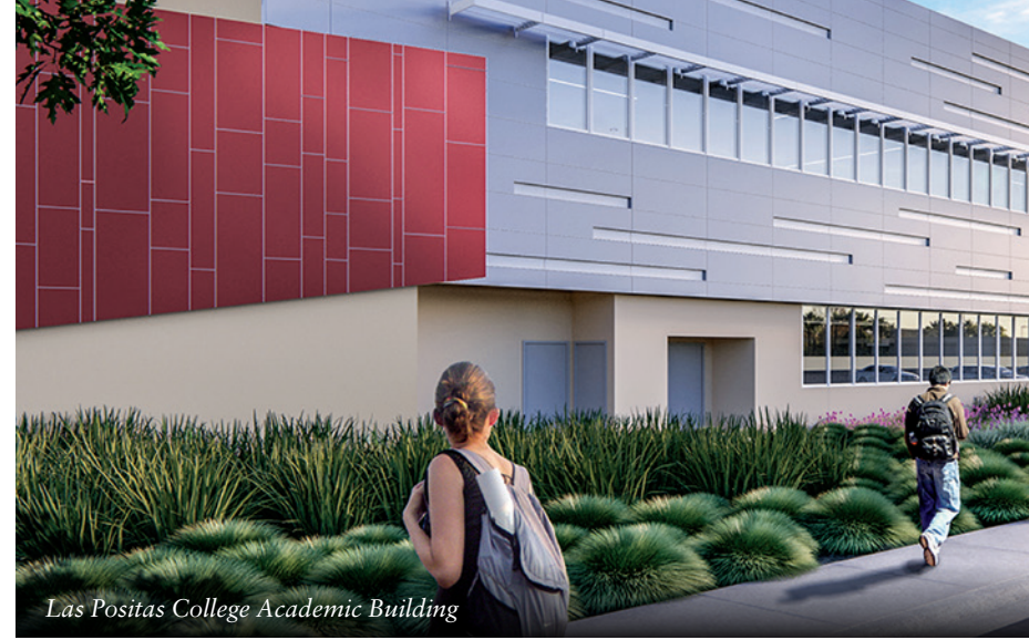
Las Positas College Academic Building