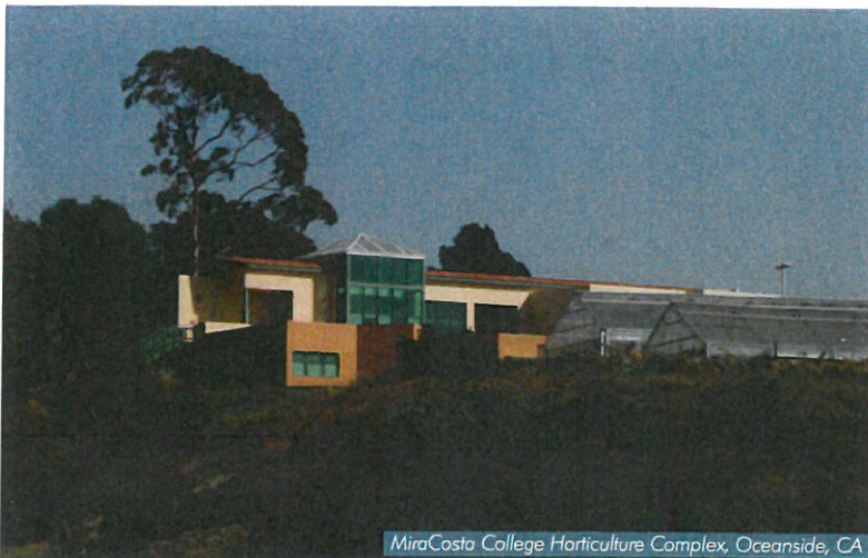
MiraCosto College Horticulture Complex, Oceanside, CA