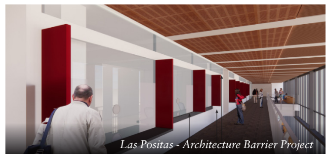
Las Positas - Architecture Barrier Project

Design team working with the College User Group, completed all design phases. In October 2020, the design team submitted Construction Documents to DSA for review and comment. Currently, Project team is awaiting DSA feedback. Anticipated Project Completion is the fall 2021.