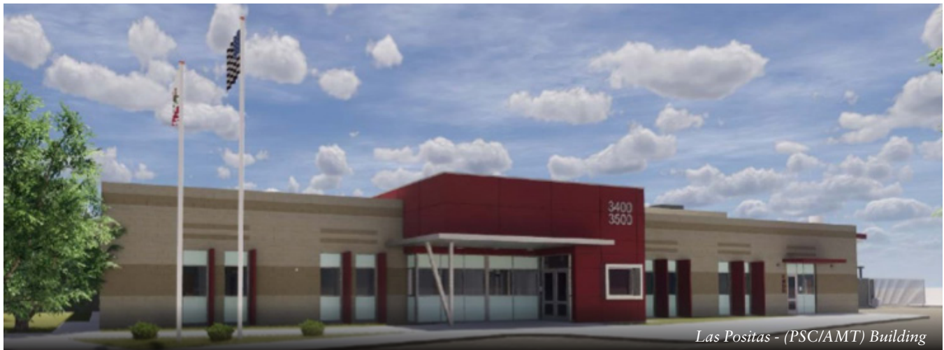
Las Positas - (PSC/AMT) Building

Design team working with Facilities and the College User Group, completed all design phases. In September 2020, the design team submitted Construction Documents to DSA for review and comment. Currently, Project team is awaiting DSA feedback. Anticipated Project Completion is the winter 2023.