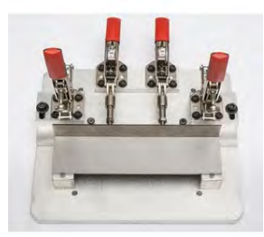
3-IN-1 WELDING FIXTURE