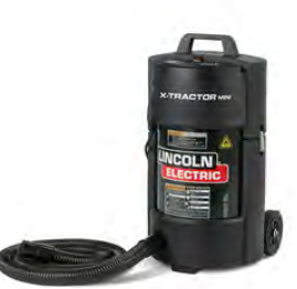
X-TRACTOR® MINI PORTABLE WELDING FUME EXTRACTOR