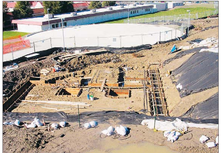
The Athletic Field House at Las Positas College