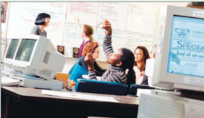
Chabot College Spectator Student Newspaper