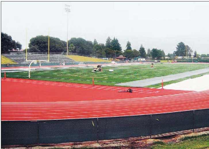
Chabot's renovated football field