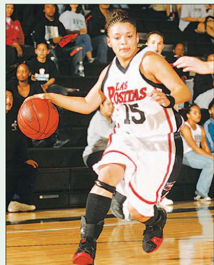
Las Positas College Lady Hawks Basketball