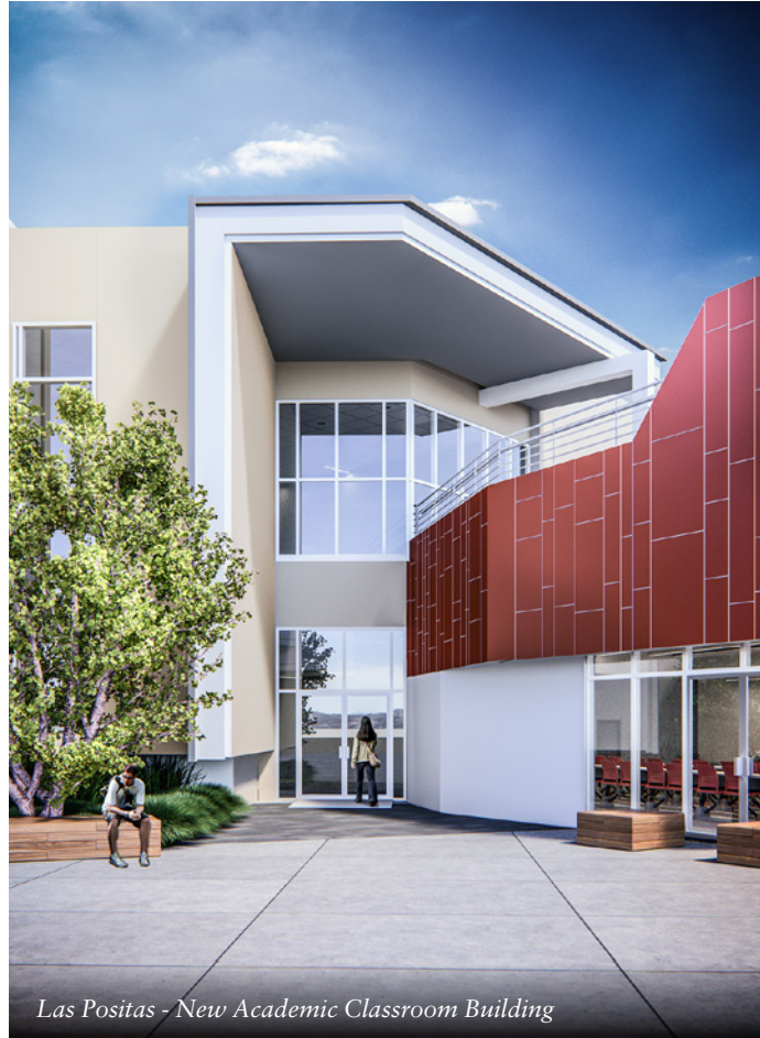
Las Positas - New Academic Classroom Building