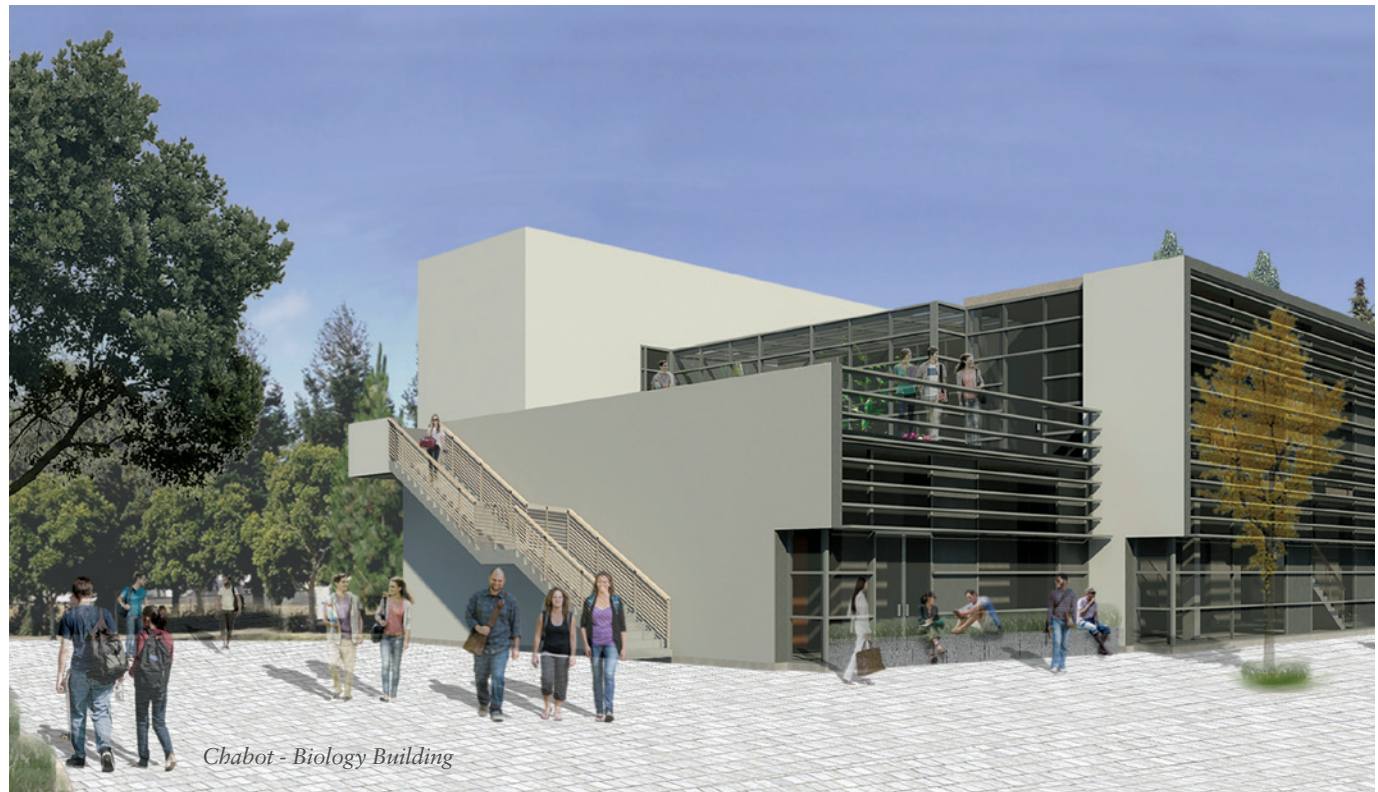
Chabot - Biology Building