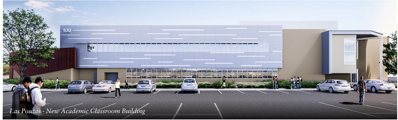
Las Positas - New Academic Classroom Building

Design is complete for the new Biology Building at Chabot College. The 19,600 square foot, two-story, steel framed building consists of 5 biology laboratories, associated support spaces and a greenhouse. Construction is scheduled to begin September 2017.