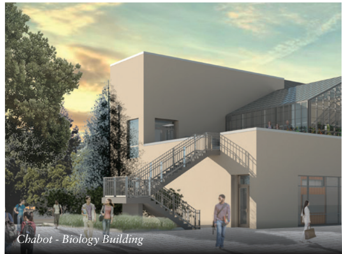
Chabot - Biology Building