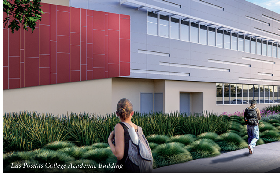
Las Positas College Academic Building