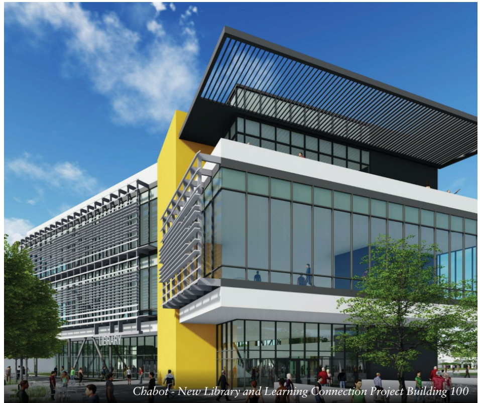
Chabot - New Library and Learning Connection Project Building 100