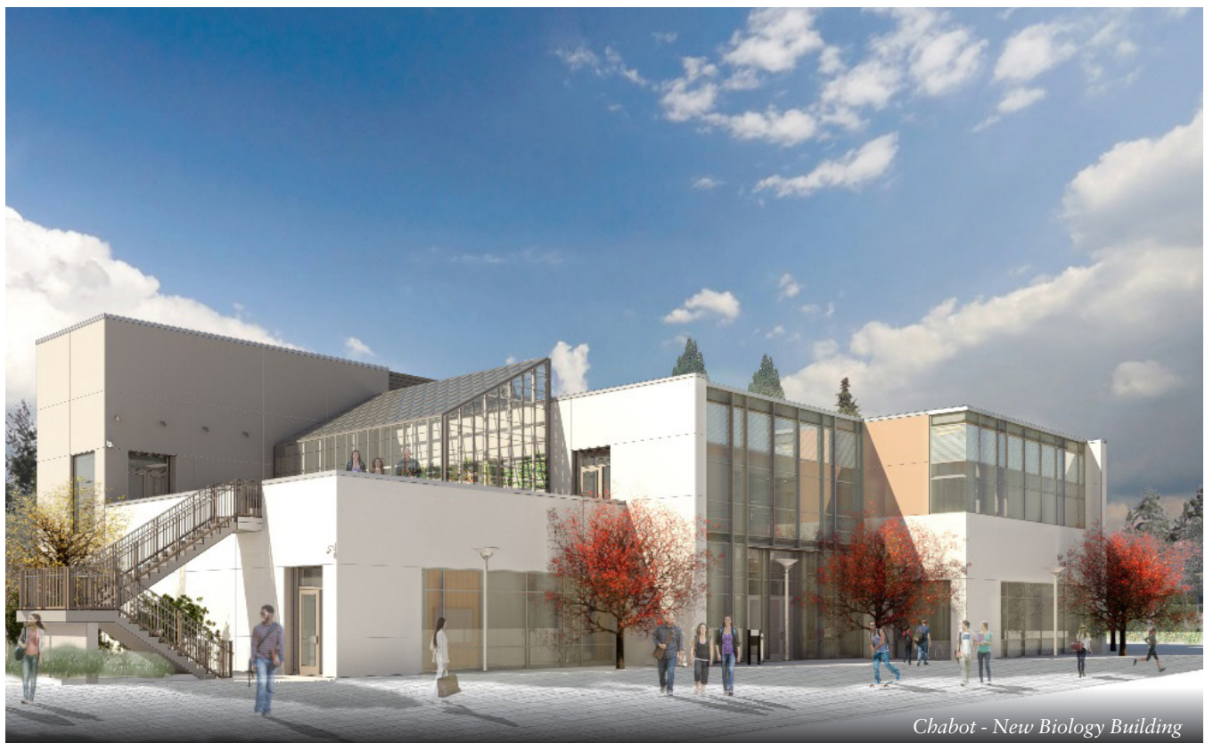
Chabot - New Biology Building

This project proposes to construct a 24,315 asf/32,405 gsf Maintenance and Operations building and equipment storage yard on the campus. The project will allow the department to consolidate all its staff, equipment and materials in a central, but out of the way location and operate in a much more efficient manner. The project will also create a safer environment for students and staff since it will move M&O vehicles, machinery, industrial chemicals away from instructional areas. It will also upgrade the non-code compliant primary restrooms for the athletic fields. As secondary effect of this project existing Building 3000 will be demolished and Building 3600 will be reviewed for repurposing of the building or building structure for additional uses either in its current location or in a new campus location.