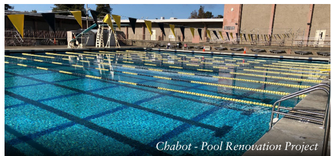
Chabot - Pool Renovation Project