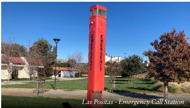
Las Positas - Emergency Call Station