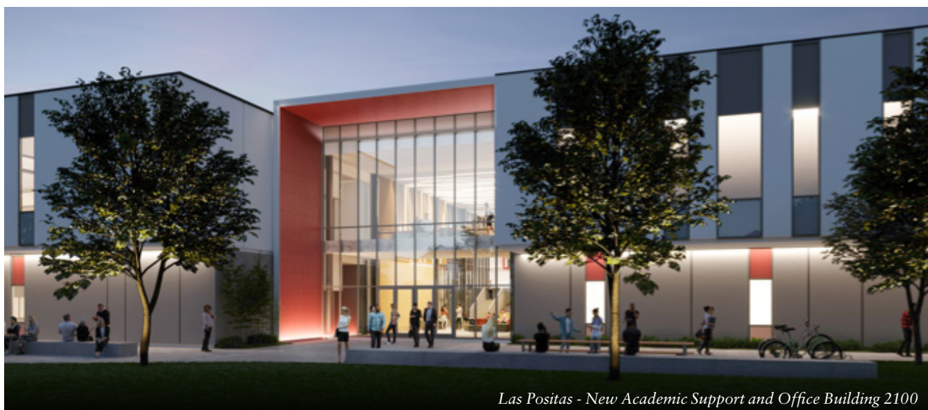
Las Positas - New Academic Support and Office Building 2100

Design team working with Facilities and the College User Group, completed all design phases. In September 2020, the design team submitted Construction Documents to DSA for review and comment in October 2020. Anticipated completion of the project in Summer/Fall 2023.