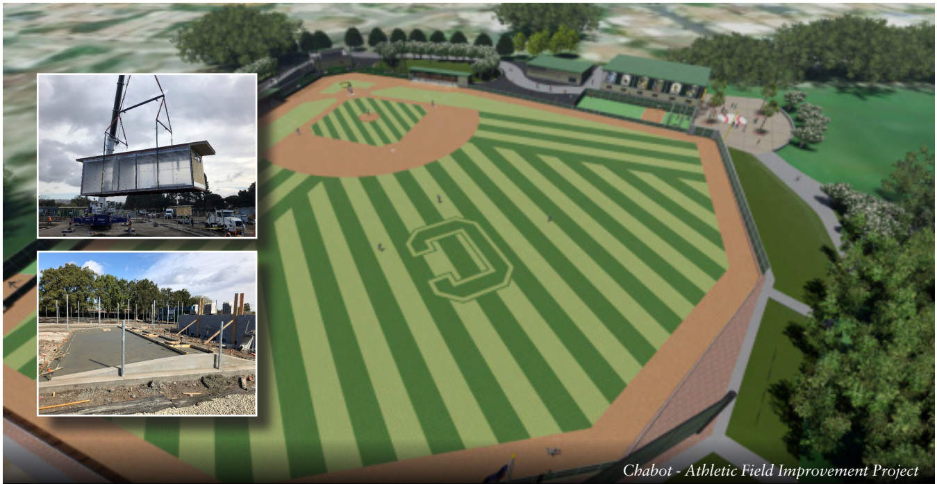
Chabot - Athletic Field Improvement Project

The Athletic Field Improvement Project consists of the removal and replacement of the existing baseball field with artificial turf. Installation of new bleachers, site lighting, dugouts, batting cages, bullpens, storage areas, and scoreboard along with the new code-compliant press box structure with restrooms and accessible pathways are also included.