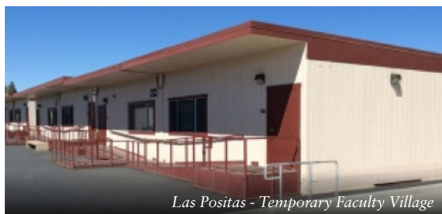
Las Positas - Temporary Faculty Village