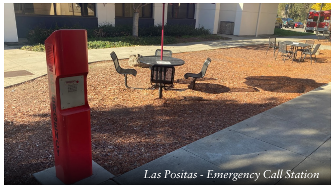
Las Positas - Emergency Call Station