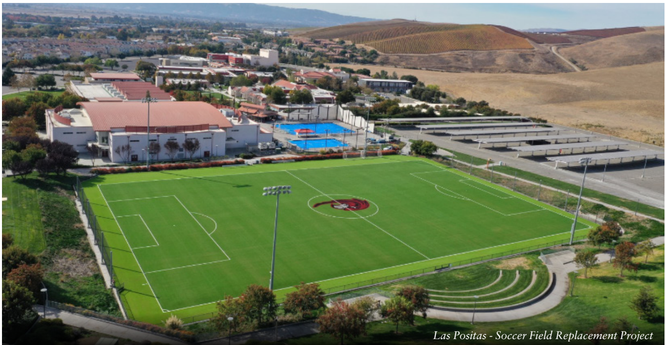
Las Positas - Soccer Field Replacement Project

The District-wide Emergency Call Station Project comprises of the procurement, installation and programming of new emergency call stations and retrofitting of existing call stations at both the Chabot and Las Positas College Campuses. This project also includes the installation of a new ECS server at the Las Positas Campus to match the existing Zenitel/STENTOFON ICX- 500 server and software at the Chabot Campus. It includes configuration and programming of both the existing Chabot ESC server and the new Las Positas server along with interfacing these servers to the existing Fire Alarm Control Panel at the respective campus to provide communication from the ECS server to the FACP. Project is in construction and is expected to be completed Summer 2021.