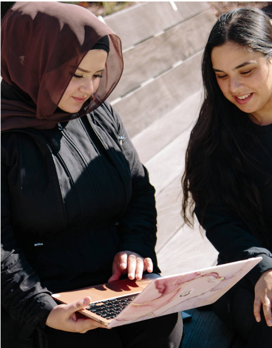
Students studying on campus.