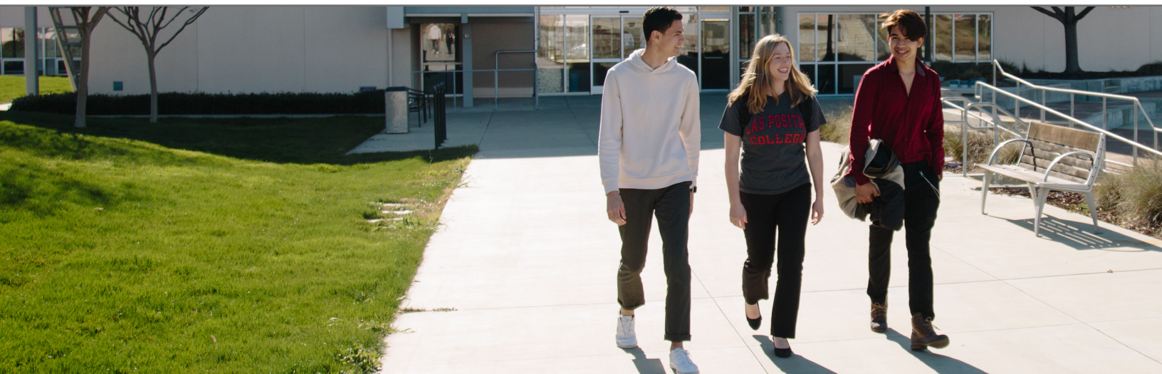
Outreach specialist on tour with students.

East Bay CAN has set out to make a clearer path to transfer and address these barriers, many of which require collaboration across the community college and university systems.