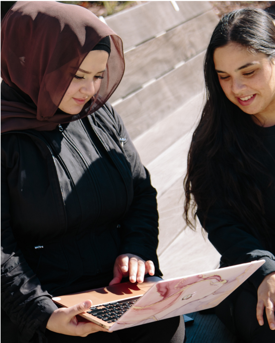
Students studying on campus.