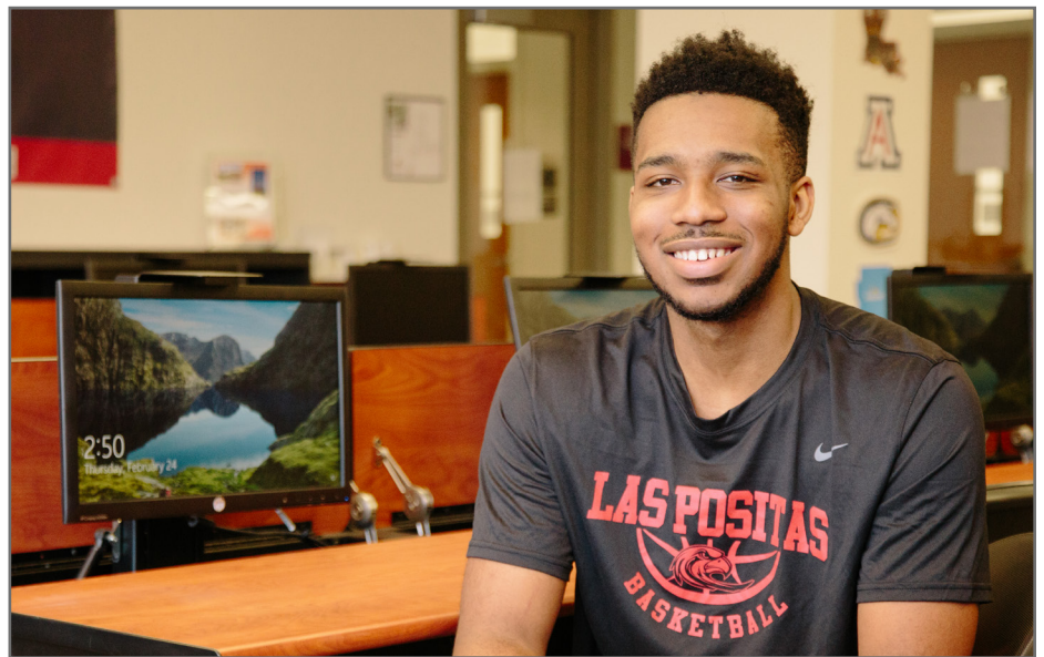
Student at Las Positas College Transfer Center.

Early in the initiative, the leadership discussed transfer issues, examined student data, and convened focus groups to shed light on the transfer landscape. This important groundwork included two research studies commissioned by the partnership: 1) The Through the Gate Replication Study by the Research and Planning (RP) Group which closely analyzes Chabot and Las Positas student data at critical points in the transfer process; and 2) The East Bay CAN Analysis which uses surveys, focus groups, student data, and process mapping to describe the transfer ecosystem among the partner colleges. Campus leaders have been working together to address the challenges and opportunities suggested by this research.