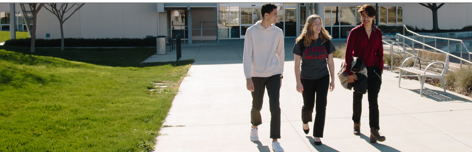
Outreach specialist on tour with students.

East Bay CAN has set out to make a clearer path to transfer and address these barriers, many of which require collaboration across the community college and university systems.