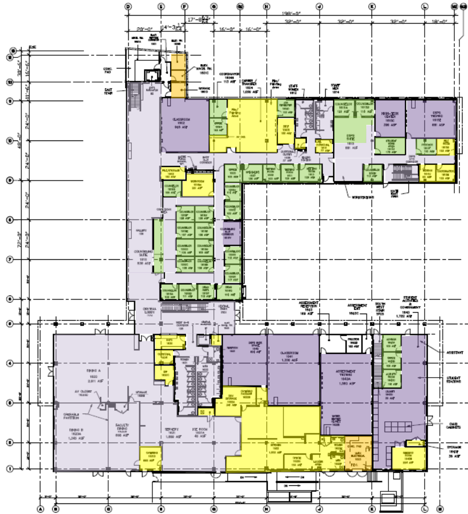
LAS POSITAS COLLEGE FIRST FLOOR PLAN/STUDENT SERVICES/ADMIN BUILDING 1600 PLAN NUMBER: 1600-01 SCALE: 1/8" = 1'-0"