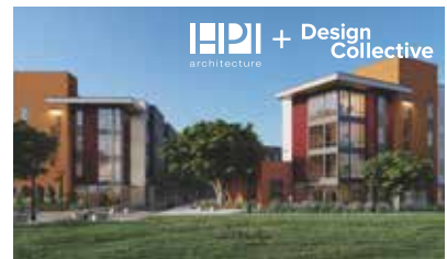
NAPA VALLEY COLLEGE