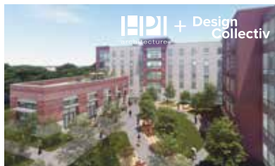
SANTA ROSA JUNIOR COLLEGE