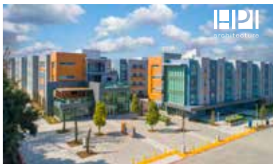
ORANGE COAST COLLEGE