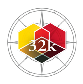
The Chabot-Las Positas Community College District serves 32 thousand students throughout the region and beyond. These students are the heart of the matter and the main focus of the EMPs and DSP.